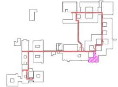
Location Plan (Level 2) showing Main Hospital Streets