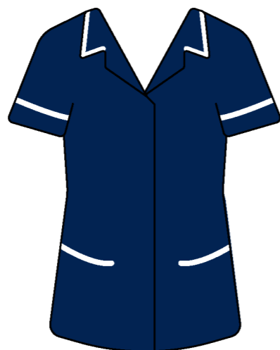
Advanced nurse practitioner

Advanced nurse practitioners assist doctors in managing chronic conditions