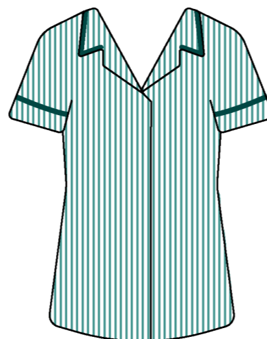
Occupational therapist assistant

Occupational therapist assistants assist the occupational therapists