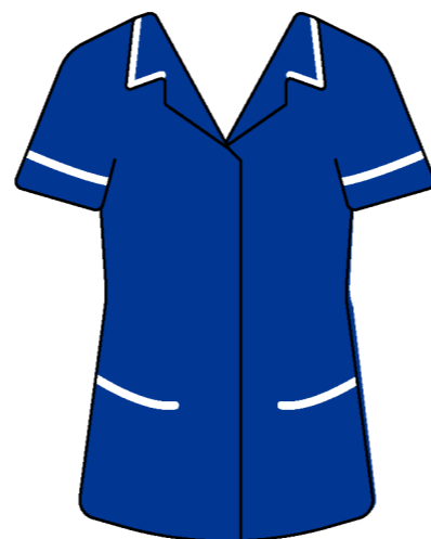
Charge nurse and sister

The sisters and charge nurses are responsible for supervising and assisting staff nurses